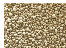
YaraMila EXTRA GRASS

Equivalent of 225 kg/ha of product 22.5 grams of EXTRA GRASS (502 granules)